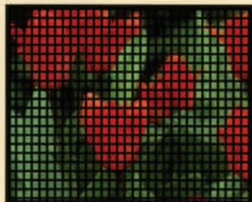
Standard 18x16 Fiberglass