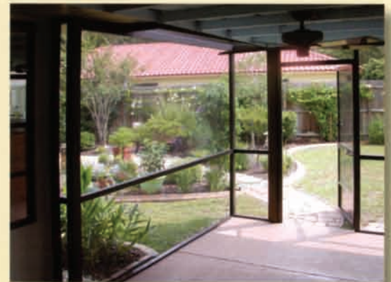
Perfect for patio door screens

While BetterVue is engineered to be undetectable from the center of a living room, it can be seen from a few feet away. This feature eliminates the risk of accidentally walking into the screen and makes BetterVue a perfect choice for patio screen doors.