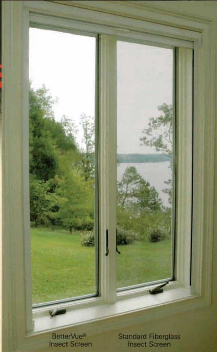
BetterVue® Insect Screen

BetterVue is GREENGUARD indoor air quality certified. GREENGUARD certification is a LEED™ requirement reference.