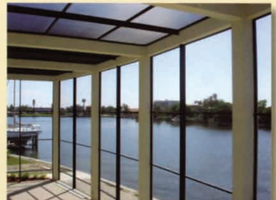
Excellent product for coastal regions

■ BetterVue screen is woven from permanent glass yarn, which has been coated with a protective vinyl to ensure lasting beauty, color and flexibility. It is produced under the most exacting conditions to meet rigid specifications. BetterVue will not rust, corrode or stain, and passed 1200 hours of QUV accelerated weathering.